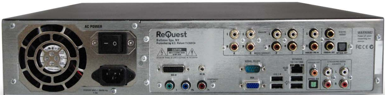
F4 Pictured. Not all ports are used. Consult our online help guides for further details.